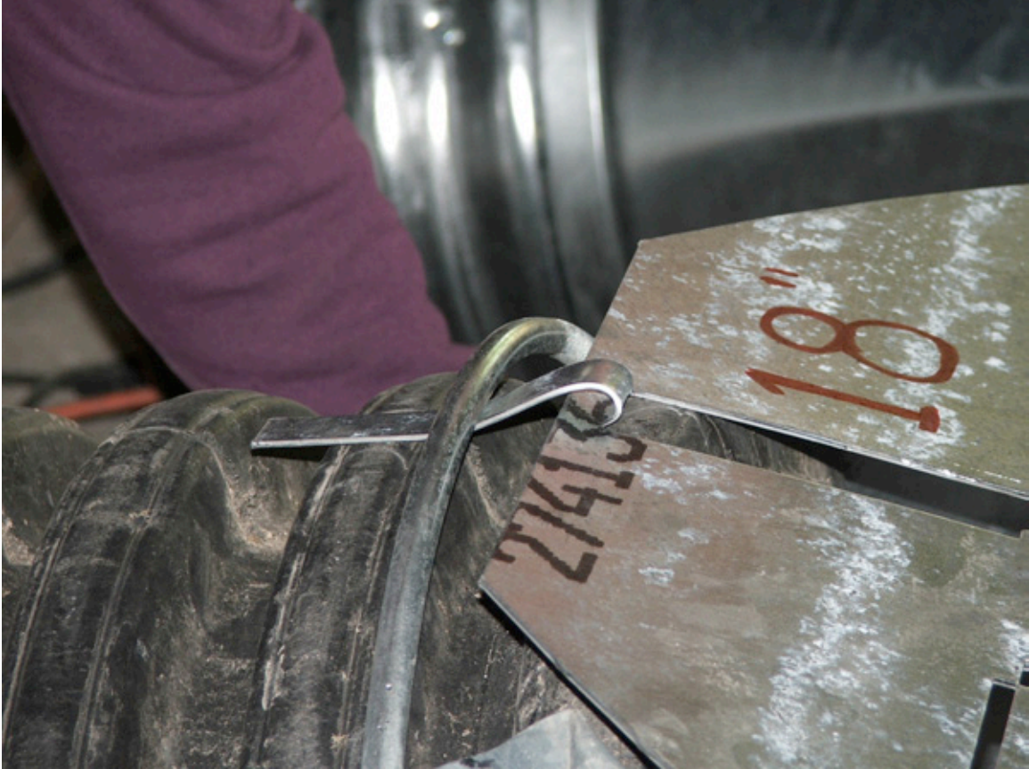
tighten connecting rod on the end section