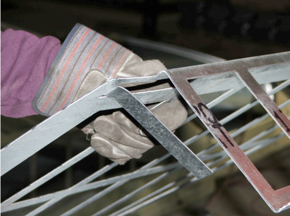
self tapping screws attach tabs to the end section